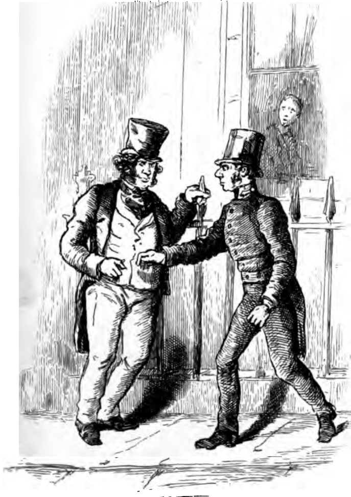
COLONEL ALTAMONT REFUSES TO MOVE ON